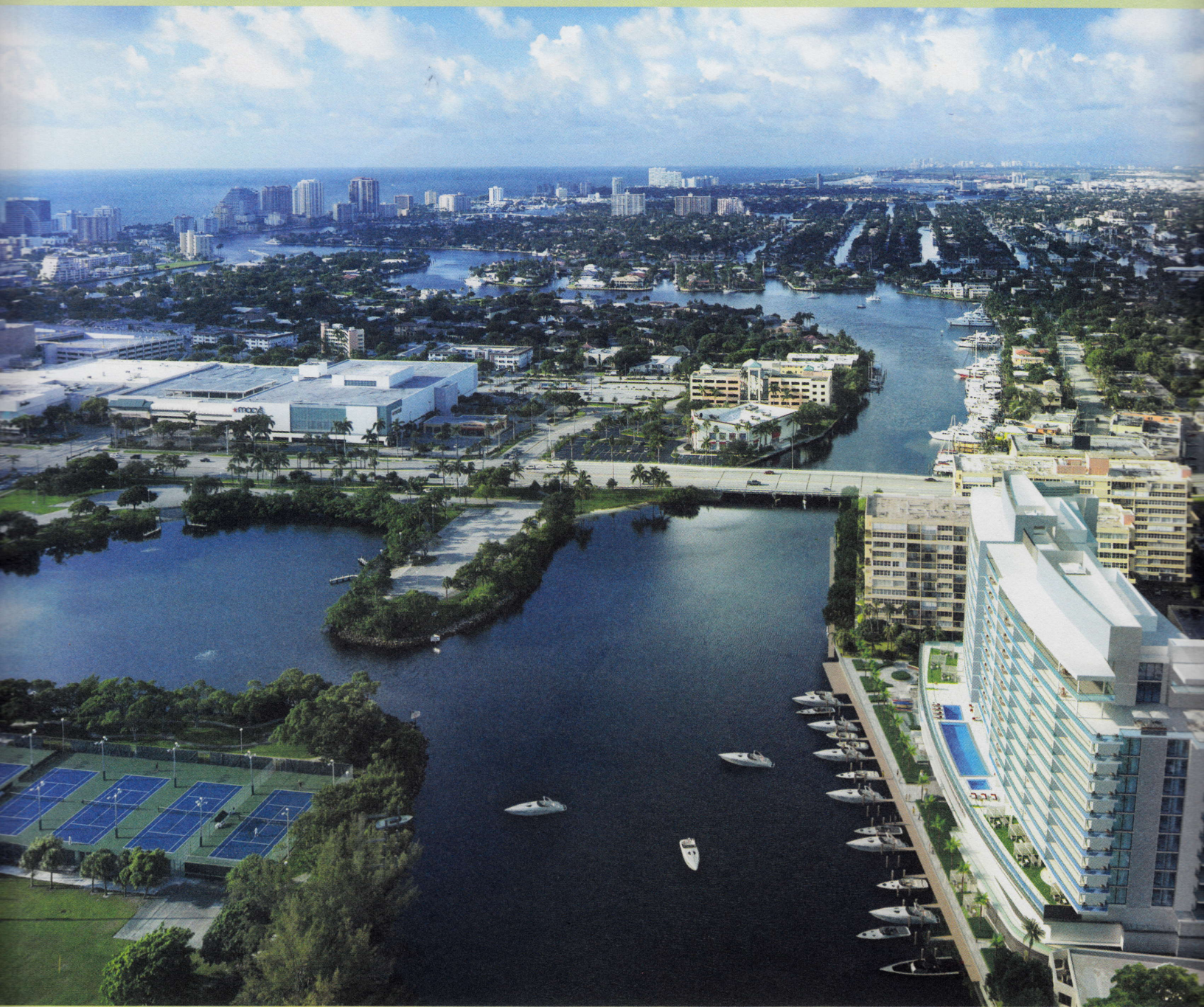
iva (at right) features a 400-foot splanade with private docks and a launch area for kayaks or paddle- boards. The 4th level pool deck faces east, looking towards the 10-acre George English Park.